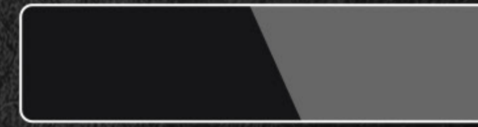
Ebony Black Gray