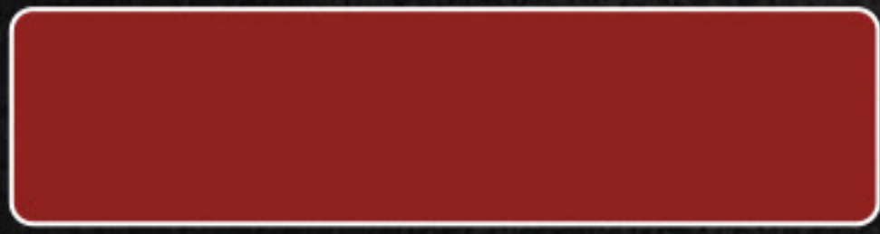
Cocktail Wine Red